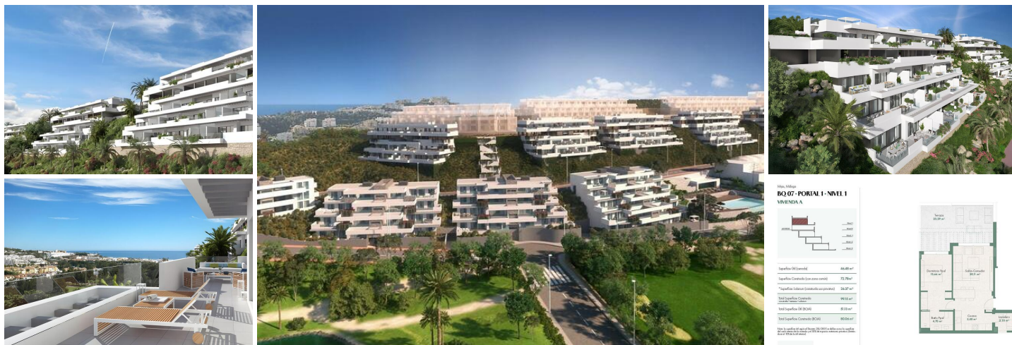
Luxury New Build Apartments with Sea Views in Las Lagunas de Mijas