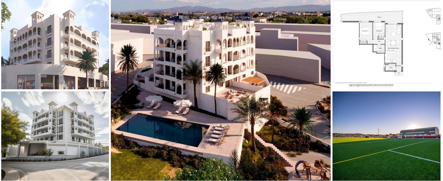
New Build Apartments in Bigastro Costa Blanca