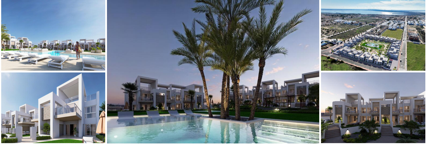
Exclusive New Build Properties in Lo Marabú, Ciudad Quesada