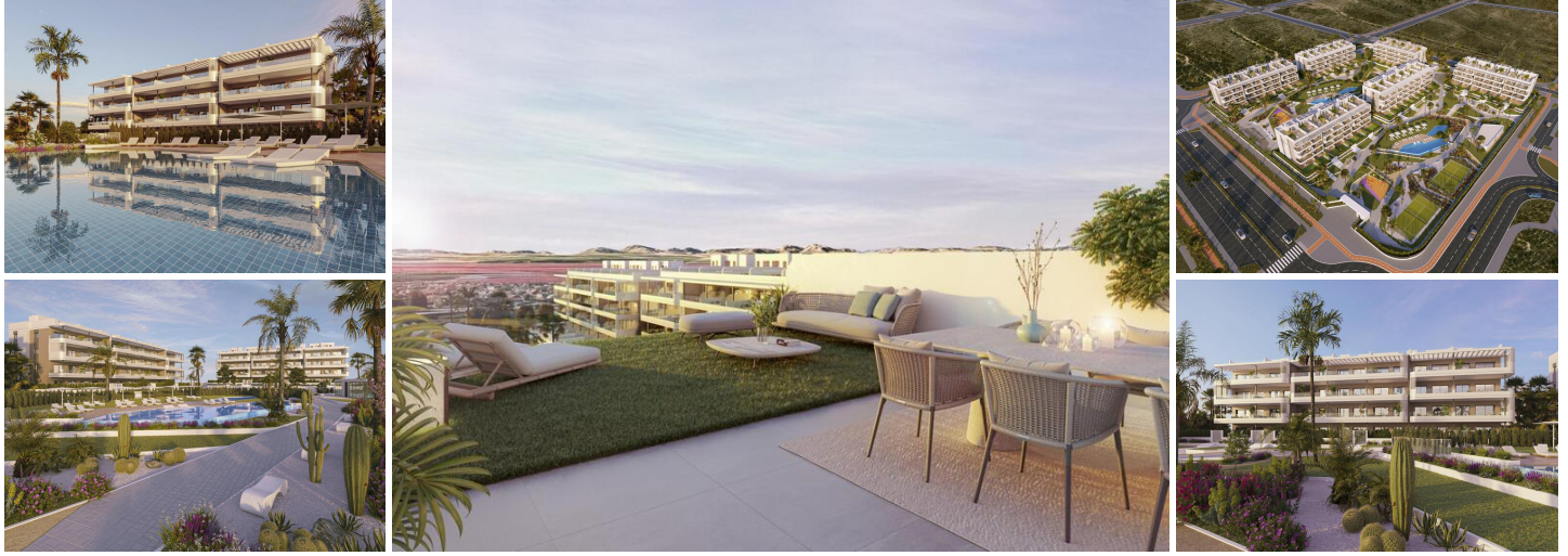
Modern New Build Apartments in La Hoya, Torrevieja