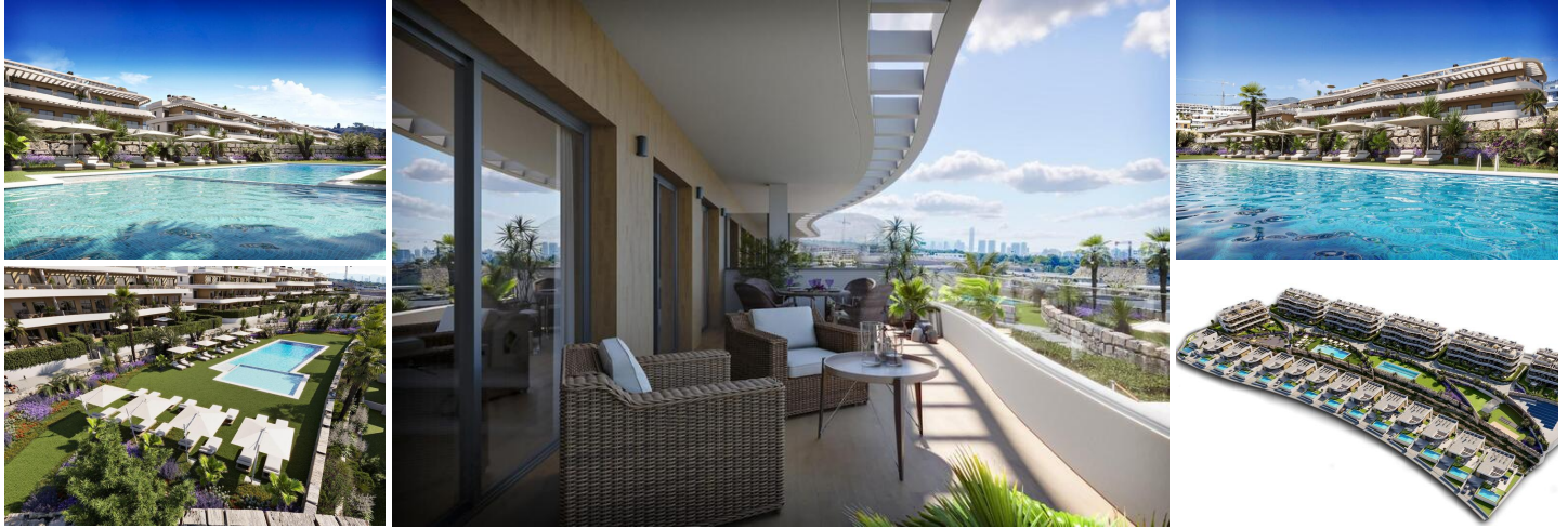
Luxury New Build Apartments and Villas with Panoramic Sea Views in Finestrat