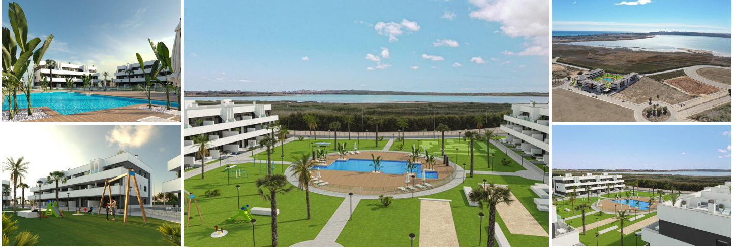
New Build Tourist Licensed Apartments with Lagoon Views in El Raso Guardamar del Segura