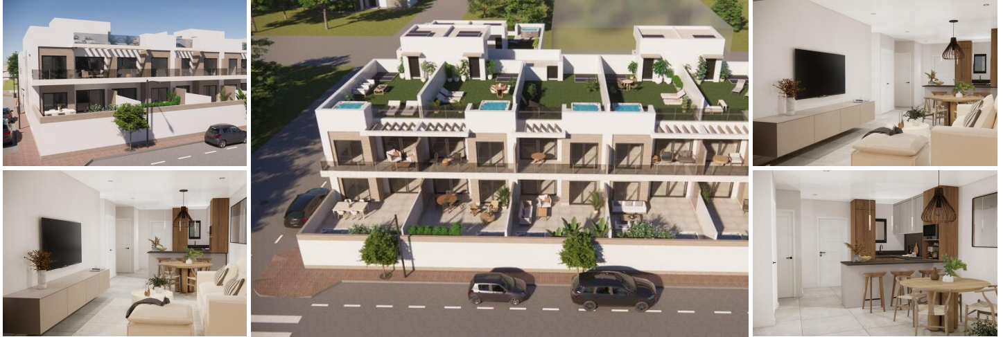
New Build Apartments in Rojales Close to Golf and Beaches