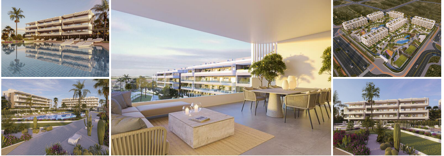
Modern New Build Apartments in La Hoya, Torrevieja