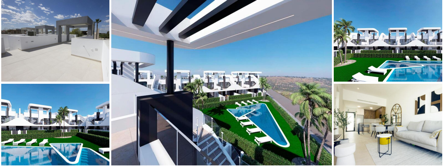
New Build Residential Complex in San Fulgencio