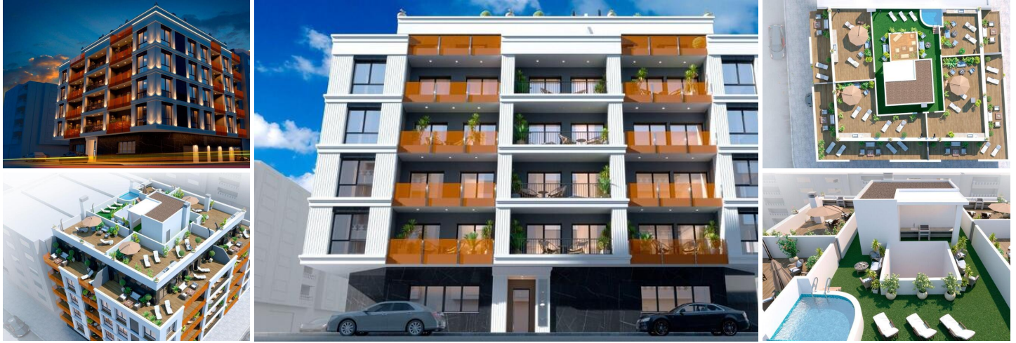
Modern New Build Apartments in Central Torrevieja Costa Blanca