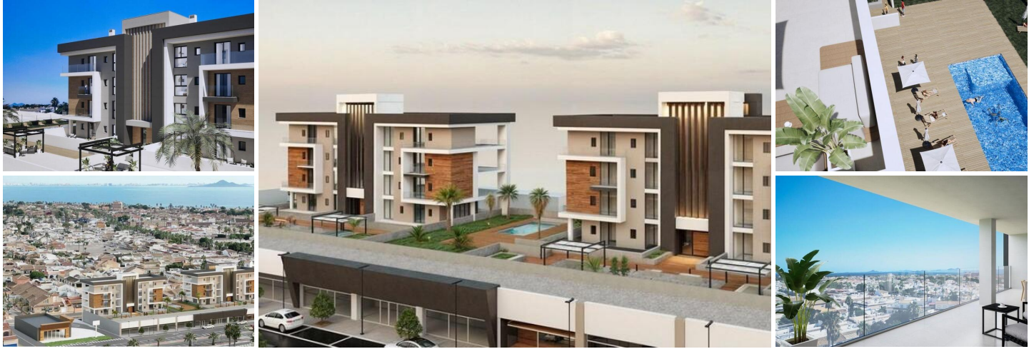
Tourist Apartments with Rental License in Los Narejos, Los Alcázares