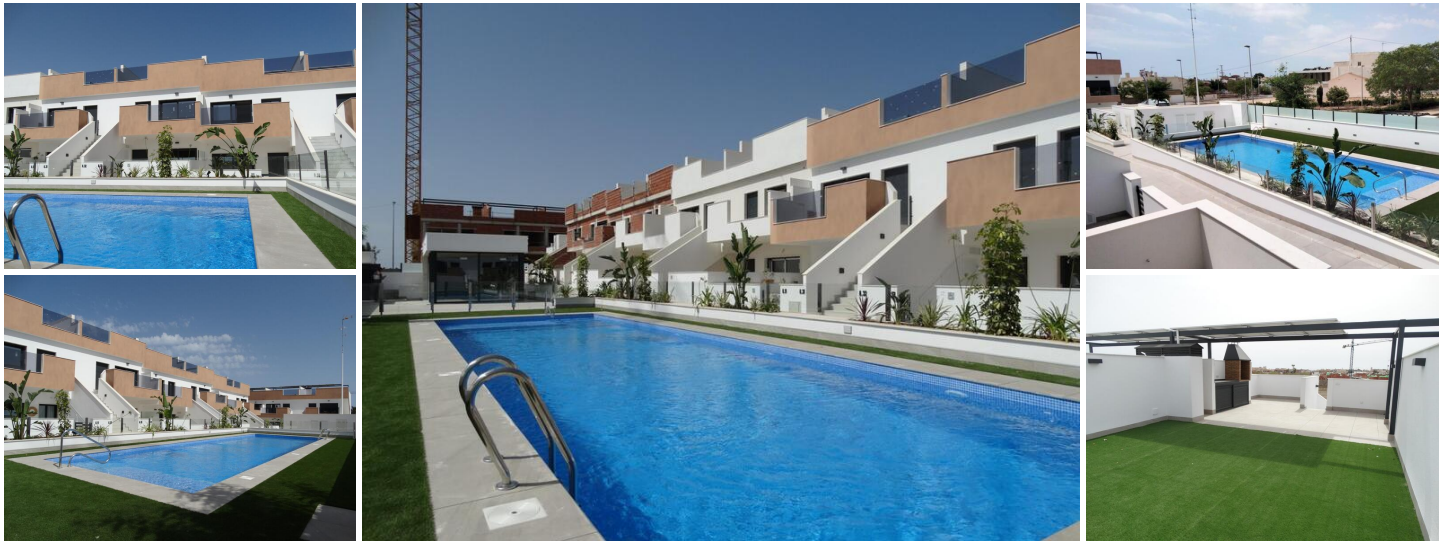
Newly Built Bungalows with Solarium or Garden in Pilar de la Horadada