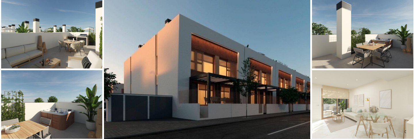
Modern Townhouses in Dolores with comunal pool