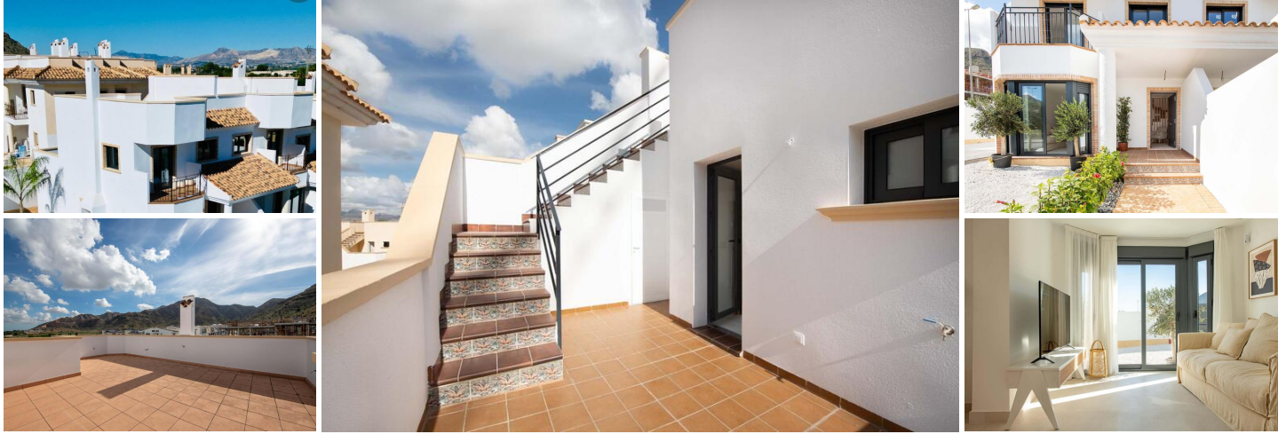
New Bungalows and Townhouses in Cox, Alicante