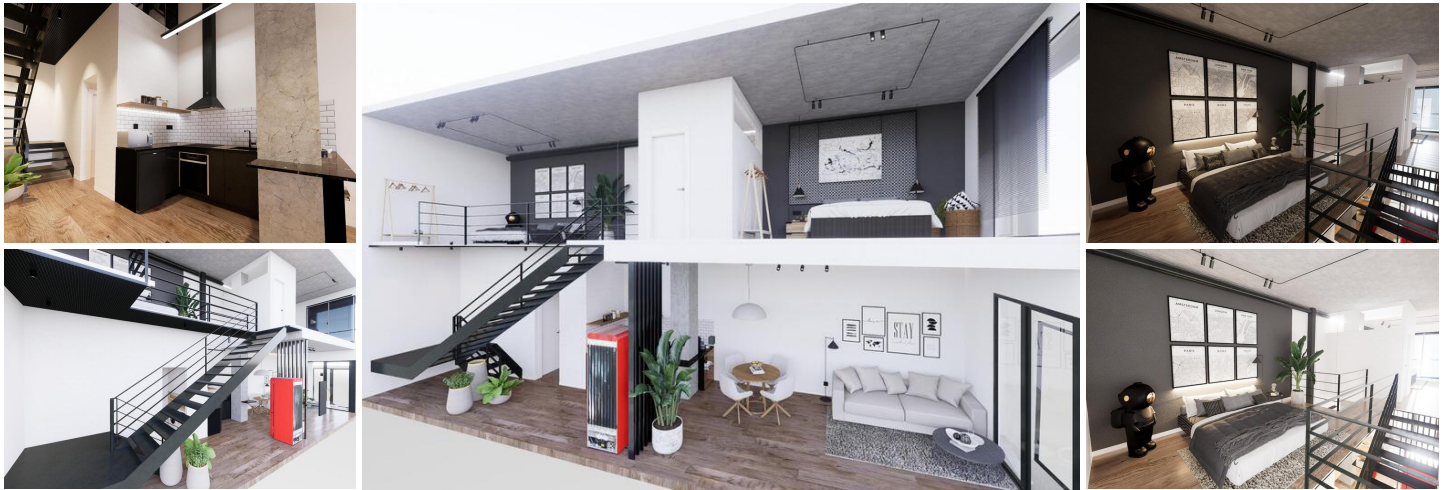
Modern Duplex Loft Apartments in the Heart of Alicante