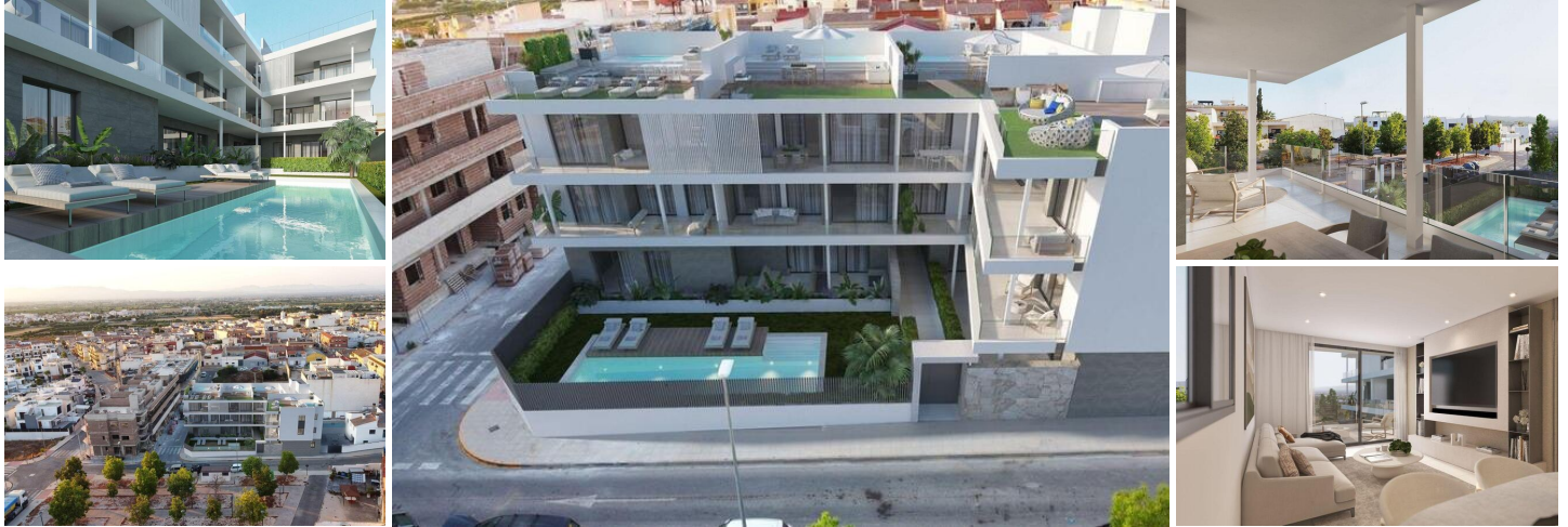
New Build Apartments in Benijofar with a central location