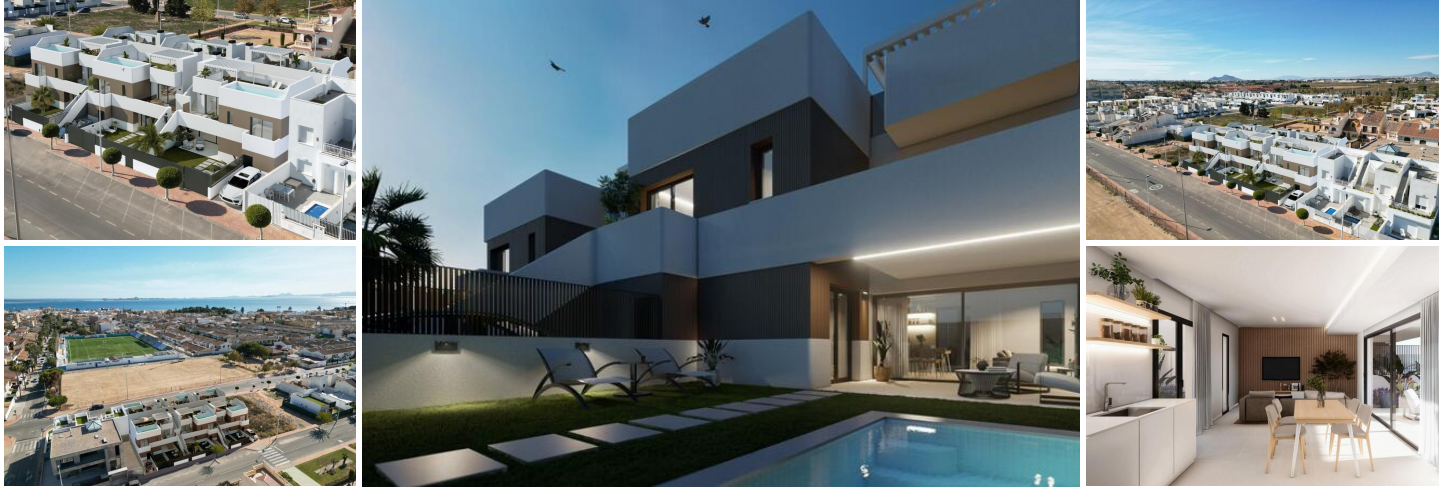
New Build Bungalows with Private Pool in San Pedro del Pinatar