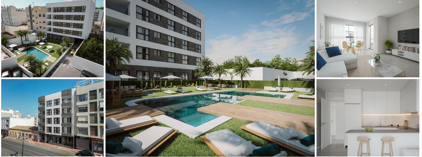
New Development Apartments in Central Guardamar del Segura, Costa Blanca