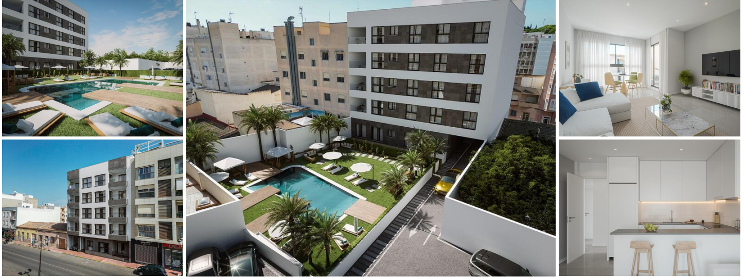
New Development Apartments in Central Guardamar del Segura, Costa Blanca