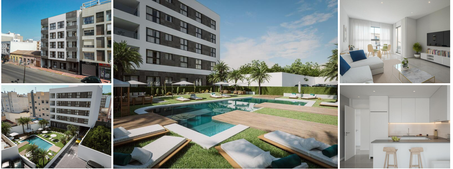
New Development Apartments in Central Guardamar del Segura, Costa Blanca