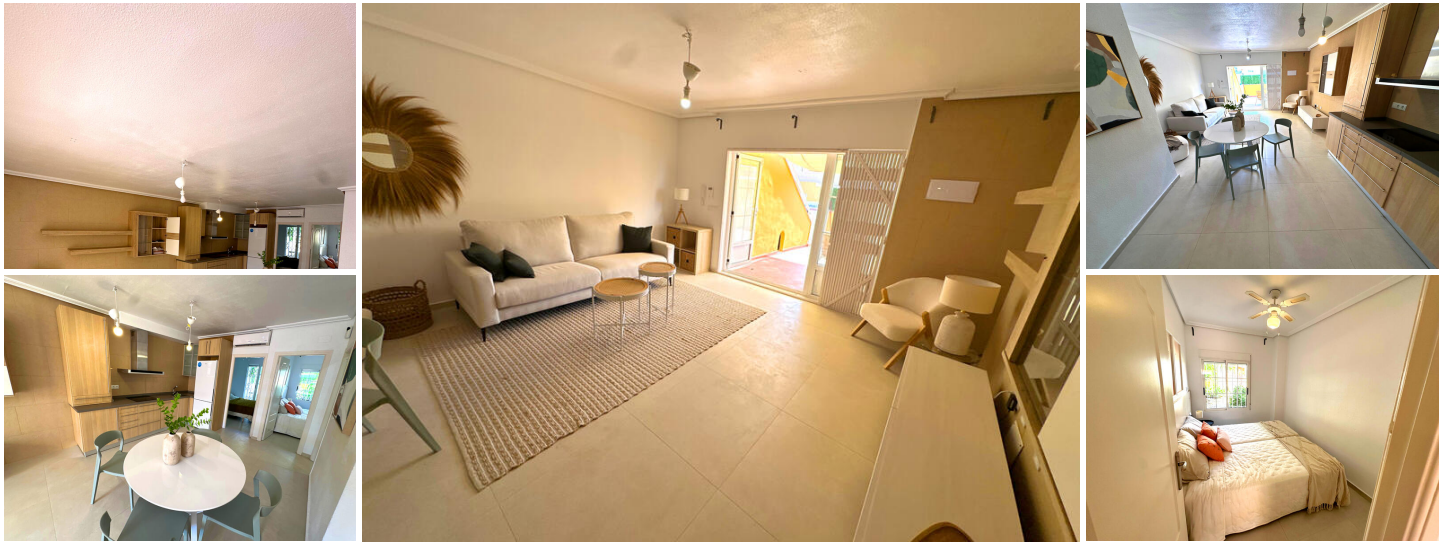
Cozy apartment near the beach