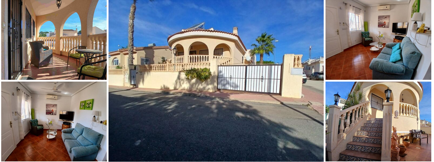
Charming Detached house with Spacious Garden and Excellent Potential in a Prime Location

Nestled in a peaceful and impeccably maintained urbanization, this delightful family home offers the perfect blend of comfort, space, and convenience—ideal for full-time living, a holiday retreat, or a smart investment opportunity in the heart of the Costa Blanca.