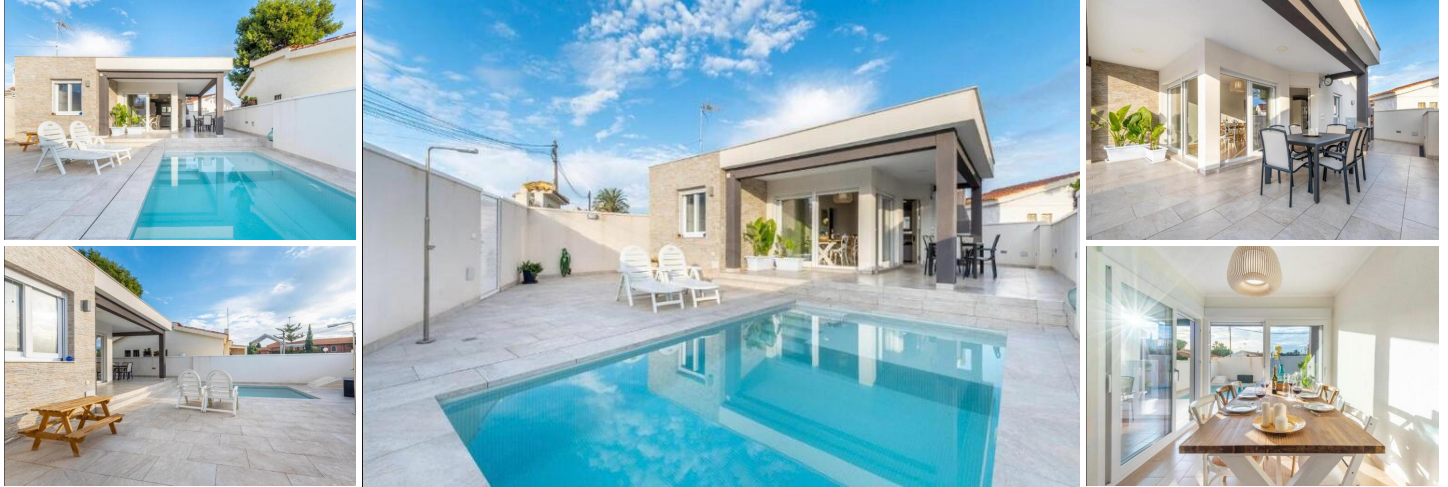
Bright independent cottage in Torrevieja