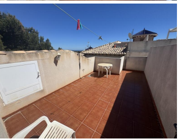
This Penthouse Corner Apartment is located on Pinada Golf 2, Villamartin.

Offering 2 bedrooms, 1 Bathroom a separate kitchen and utility room and large west facing balcony.