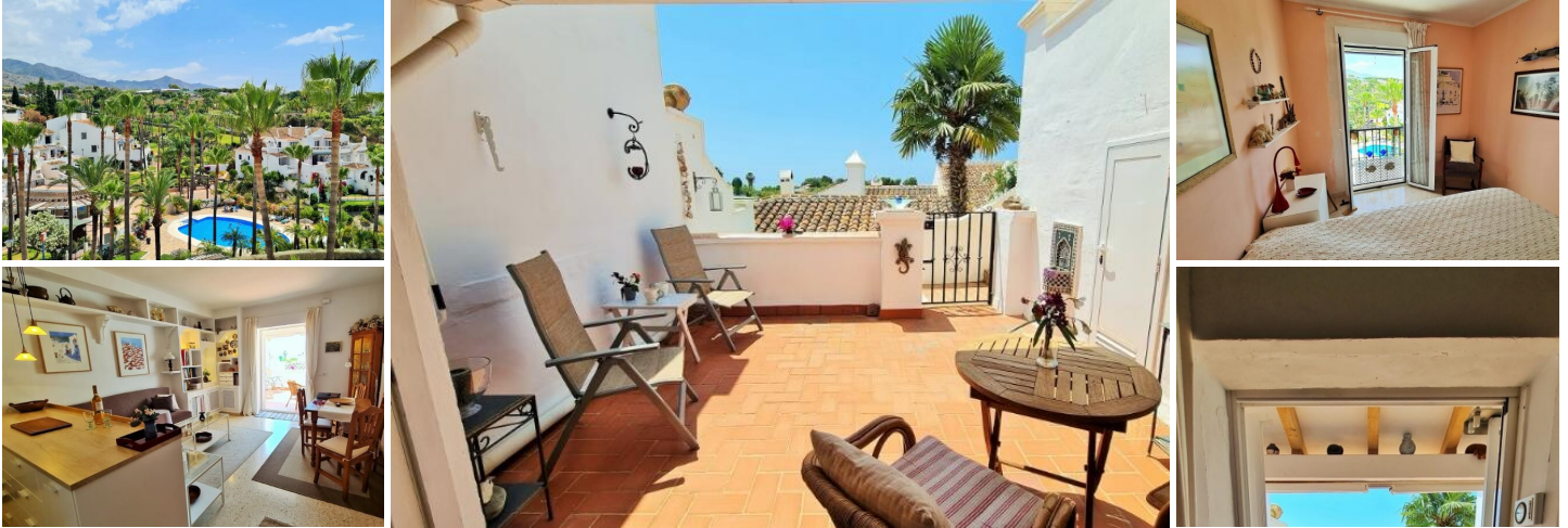
Apartment In Oasis De Capistrano Nerja for sale

This charming two bedroom apartment in the prestigious Oasis de Capistrano development could be just what you need.