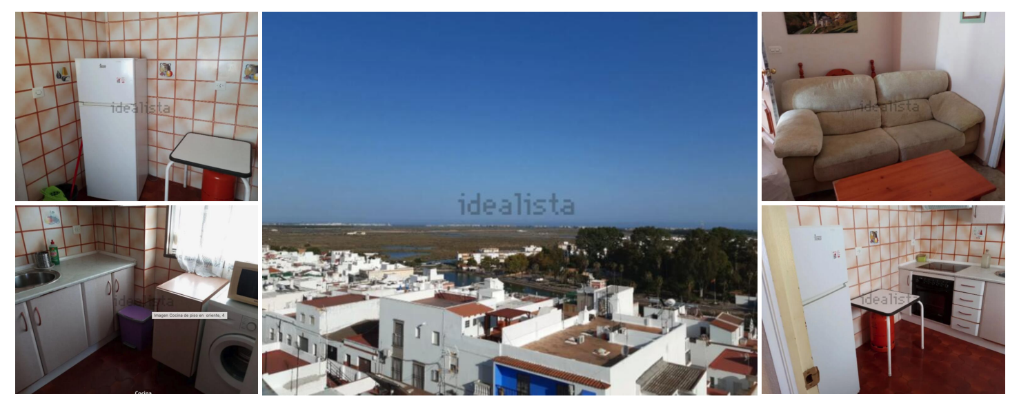
**Charming Apartment in Upper Ayamonte with Stunning Views**

Discover the perfect blend of comfort and convenience in this charming apartment located in the picturesque upper centre of Ayamonte. With 80m<sup>2</sup> built and 75m<sup>2</sup> of usable space, this delightful residence offers two cozy bedrooms— one double and one single—ideal for a small family or as a holiday retreat. The large bathroom features a modern shower, ensuring a refreshing start to your day.