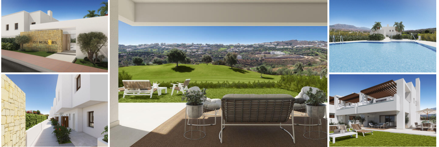
THE MEADOWS, BRAND NEW TOWNHOUSES FOR SALE AT LA CALA GOLF RESORT, MIJAS, COSTA DEL SOL

The Meadows is a new project in La Cala Resort formed by 26 spacious townhouses in front line golf position with panoramic views of the resort and Mijas valley. South-west orientation. The homes are distributed over 3 levels in a private gated community with communal pool and gardens.