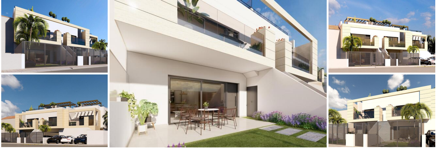
New Build Bungalows in Lo Pagán: Modern Living Near the Beach