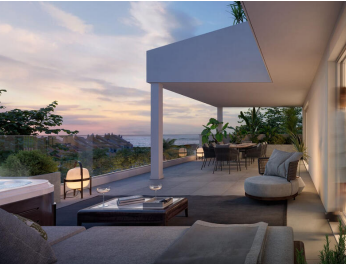
¡Exclusive promotion of 8 homes in an exceptional environment, 300m from the beach!

Homes with 1, 2, and 3 bedrooms, as well as 2 duplex penthouses with 3 bedrooms. A new construction promotion designed for people who want to invest in quality of life, thanks to the optimal distribution of spaces, functionality, brightness, and the quality of construction materials that will be used, highlighting their spacious terraces with optional jacuzzi.