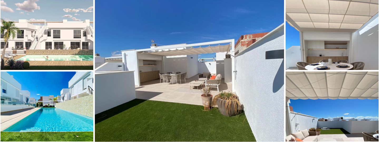
New Build Bungalow Residential Complex in Pilar de la Horadada