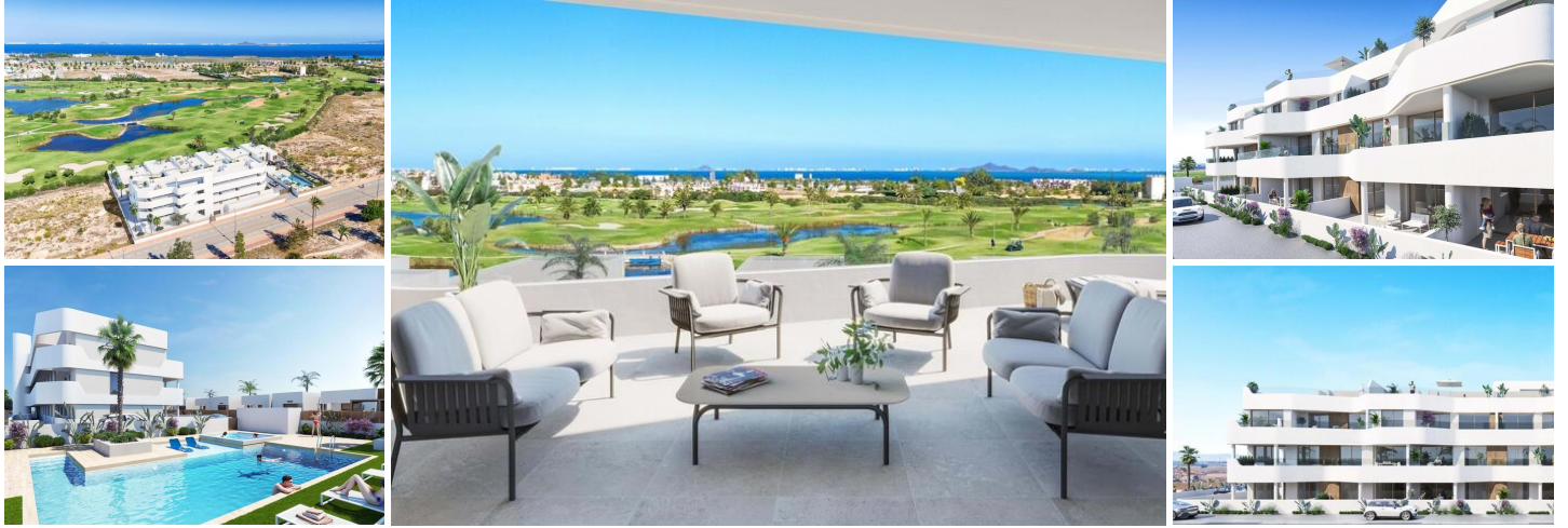
New Build Residential complex in Los Alcazares

Los Alcázares is an idyllic location for those looking to invest in a new residential property on the Costa Cálida. Just 25 minutes from Murcia Airport and approximately 55 minutes from Alicante Airport, this area is conveniently connected by highway to major cities like Cartagena, Murcia, and Alicante, as well as to other beautiful beaches along the Costa Cálida and Costa Blanca.