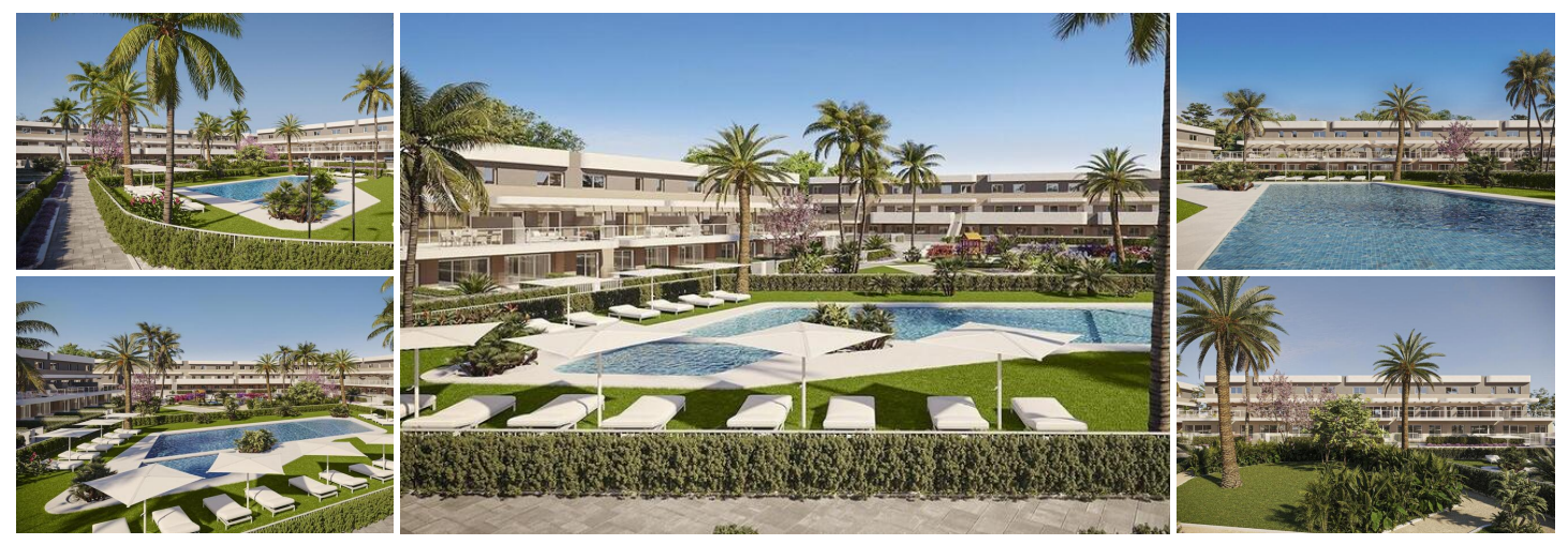
NEW BUILD RESIDENTIAL COMPLEX IN ALENDA GOLF, ALICANTE

New Build private development of beautiful 2 and 3 bedrooms apartments with large terraces overlooking the nice communal area, combines the tranquil area of the Alenda Golf Course with a more lively beachfront nightlife easily accessible in just 15 minutes.