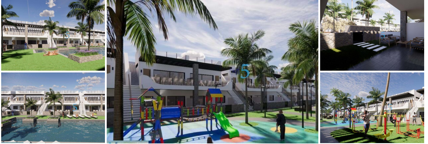
NEW BUILD RESIDENTIAL COMPLEX IN PUNTA PRIMA

Beautiful New Build residential complex of apartment, bungalows and villas located in Punta Prima, Torrevieja.