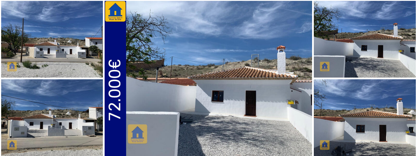
Cueva Mario 2 in Castilléjar

Superb, brand new cave house, situated on the outskirts of the peaceful, traditional village of Castilléjar, with views of the dramatic Badlands. The house is south facing and has a large front patio with ample space for parking. There is a spacious, open plan living/dining room, kitchen, a central hall and three bedrooms (one walk-through), bathroom, and a small room for a walk-in closet or an office. The kitchen is prepared for all the connections (to be furnished by the new owner). The central hall has a light well providing natural light deeper into the cave.