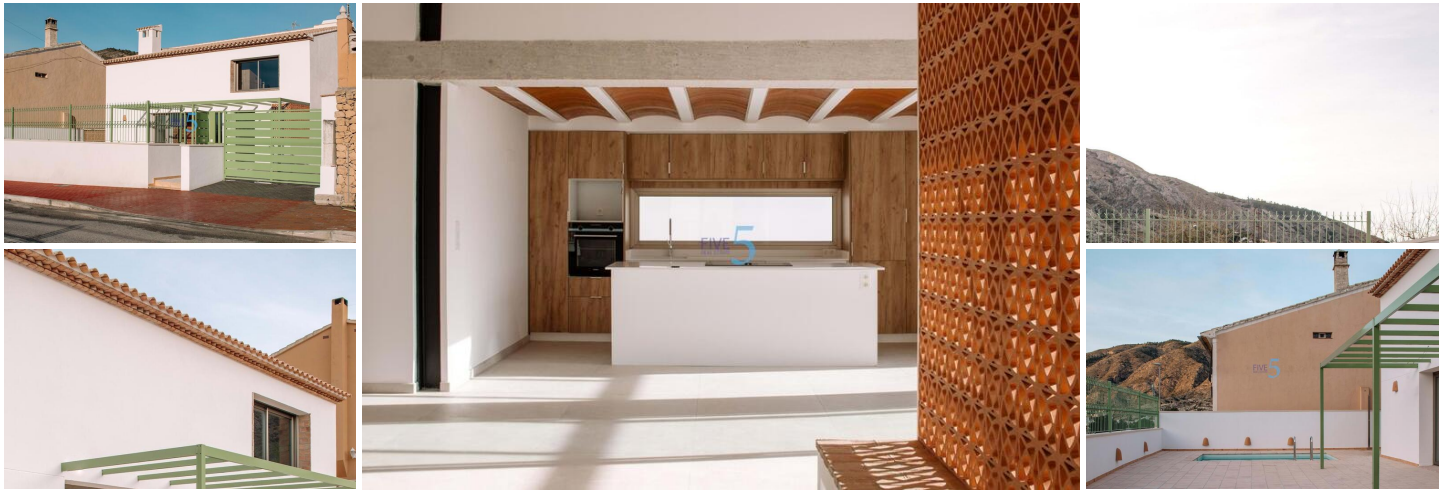
NEW BUILD VILLA IN ORXETA

New Build a single-family house in Orxeta, a peacefully town in a beautiful and fertile valley on the banks of the Sella river, and near to the coast.