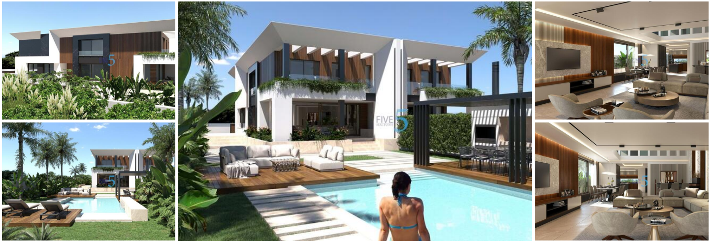
NEW BUILD SEMI-DETACHED VILLAS IN LOS BALCONES, TORREVIEJA

New Build development of 2 luxury semi-detached villas with 4 bedroom, 5 bathrooms with the latest innovation and luxury finishes, located in Los Balcones, Torrevieja.