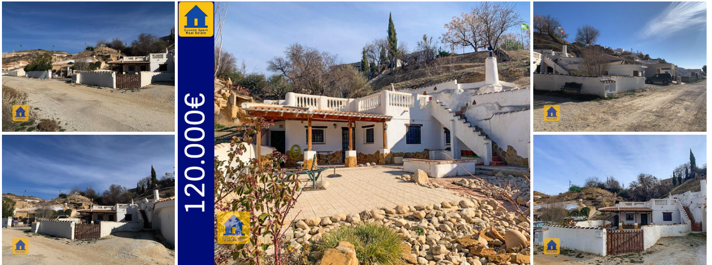
Cueva Caroline in Huéscar

Cueva Caroline is a beautiful cave property situated on the edge of the small town of Huéscar on the Altiplano de Granada. The property has ample outside space with a large front patio, a pergola and a large roof terrace. Inside, the cave house has an open plan living room/dining room/kitchen, a snug, 4 bedrooms, 2 bathrooms and a separate utility room. This cave house is built throughout with exceptionally high quality materials including ceiling insulation.