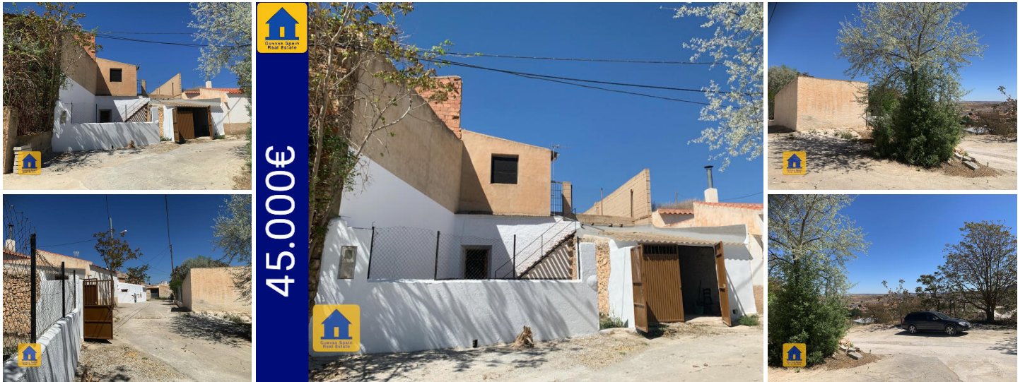
Cueva Isabel in Orce

This cave property is located in a quiet neighbourhood of the beautiful village of Orce. It is built on two levels, with two large, enclosed patios, a large workshop space, and a garage. The living space consists of a small sitting room/hall with an open fireplace and traditional bread oven, 2 bedrooms and a shower room. There is currently no kitchen. Across the road is additional parking space for several cars. There are far reaching views of the village of Orce and mountains beyond.