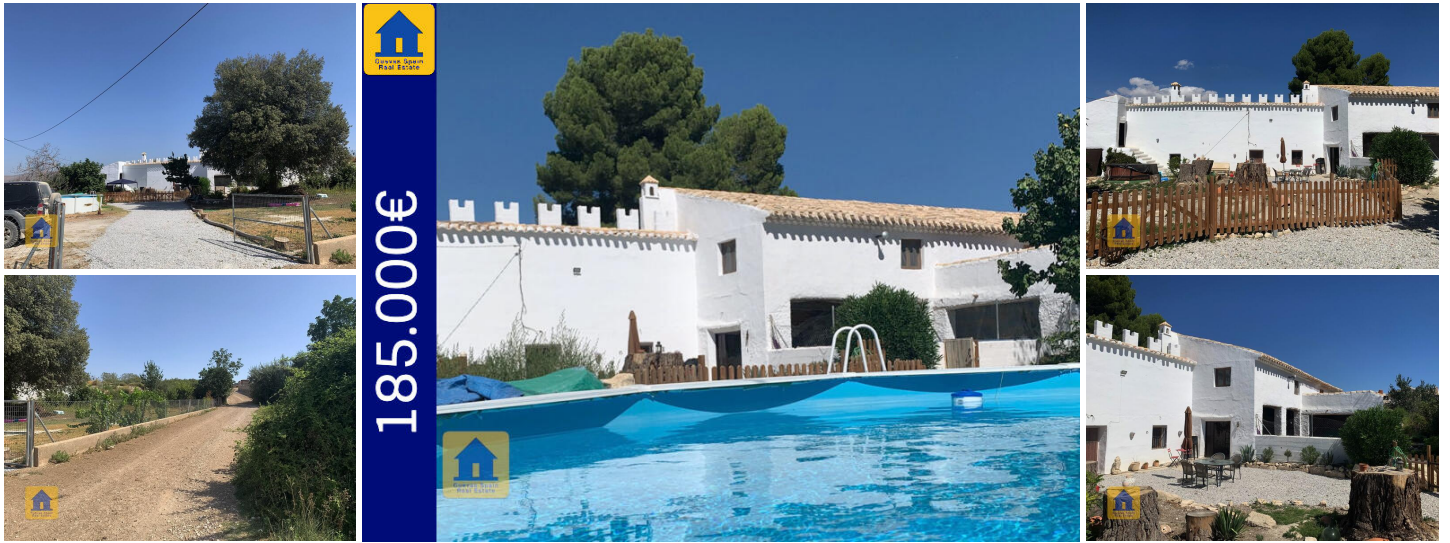
Cueva Los Corales in Galera Riego Nuevo