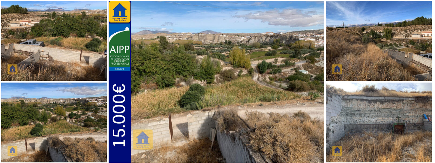
Cueva Mari Carmen Castilléjar

Small troglodyte house to renovate with fantastic views, just 1km from the village of Castilléjar. Access is good and includes a dirt road for about 100m to reach the property. The orientation is north-east and faces the surrounding hills and the village. Water and electricity are at the door so easy to connect. The cave house can be converted and enlarged to provide an extra door or a window or both. The patio is large enough to have either a parking space or a small private garden.