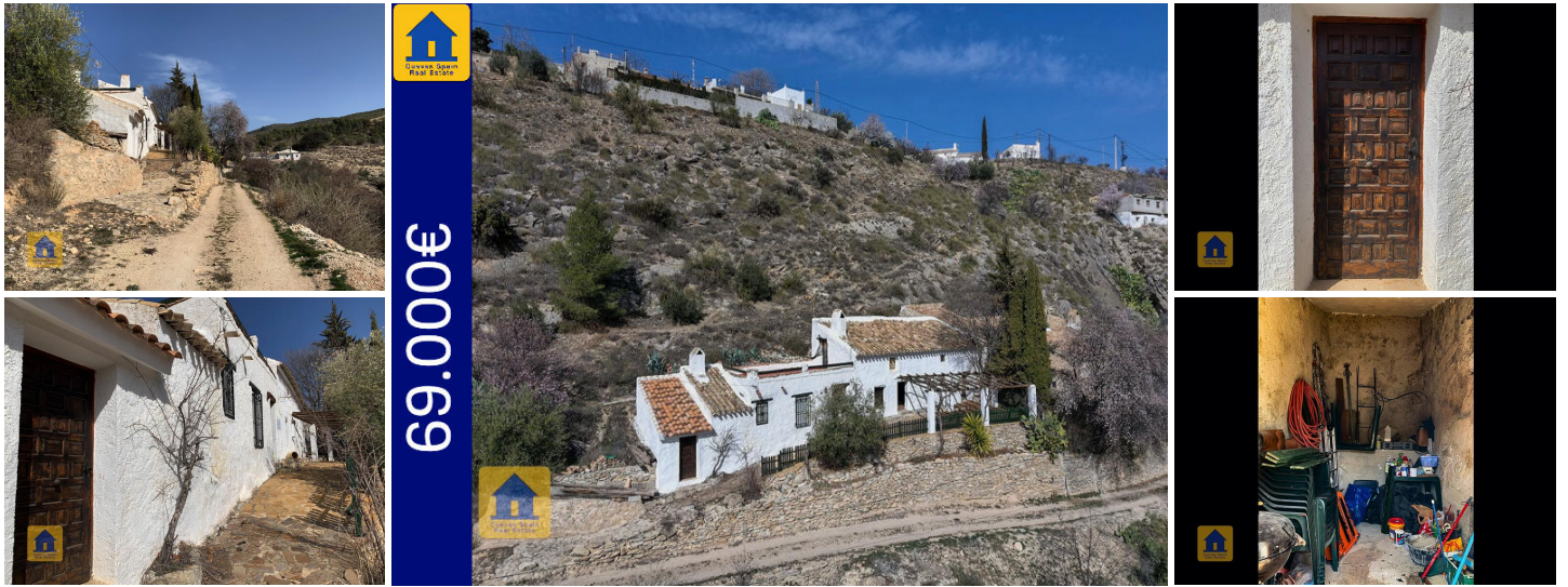
Casa Cristina in Duda

If you are looking for a holiday home or full time home in a beautiful, remote spot, this house might be for you! This delightful and quaint little house is located on a hillside of the charming hamlet of Duda, about a mile from the San Clemente reservoir. The house has views across the lush valley and you can hear the stream running down below. The property is attached on one side to a house that is not inhabited. The next neighbour is about 70m down the track.