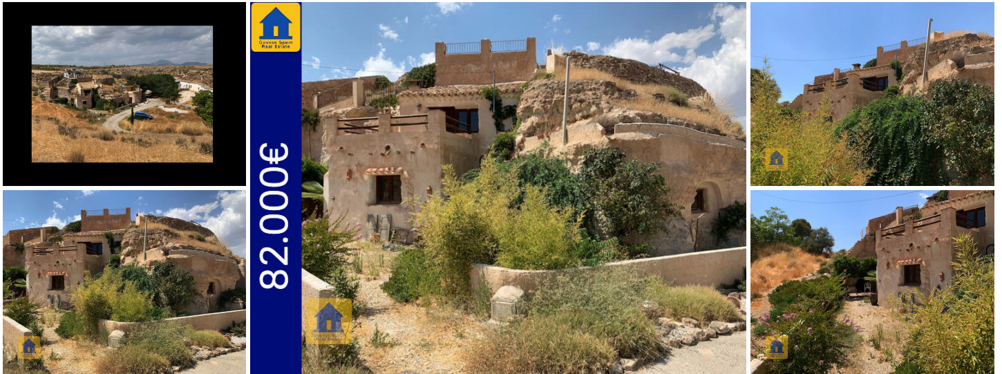
La Alqueria Cave House Divine

If you have ever dreamed of 'castles in Spain', this little gem could be just the thing for you. This unusual cave house is nestled in the curve of a hill in the hamlet of Alquería near the pretty village of Galera in Granada Province. The property has the feel of a fairytale house. It has 3-4 bedrooms, 2 bathrooms, a self-contained rooftop guest unit plus a small unreformed cave. This property has tons of potential to become whatever your imagination conjures up.