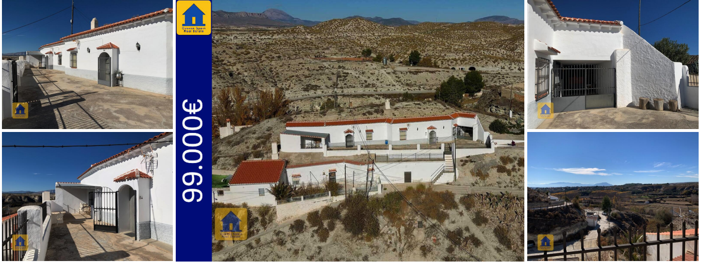
Cueva Yolanda Castilléjar

Fantastic cave house with stunning views of the badlands across the valley! The cave is very large and can be separated into 2 units, each with its own entrance, kitchen and bathroom. A private driveway leads to the gate and onto an expansive terrace with wide open views and a cozy covered sitting area at the far end. To the right upon entering the patio is the garage with a door leading into the house (The garage is currently used for wood storage.) There is a pantry/bodega and a laundry room. The property also has an underground room used for storing wood, and another cave with 2 rooms that was used for animals in the past and now has wood storage, accessible from the main road. There is ample space to park several cars on the property.