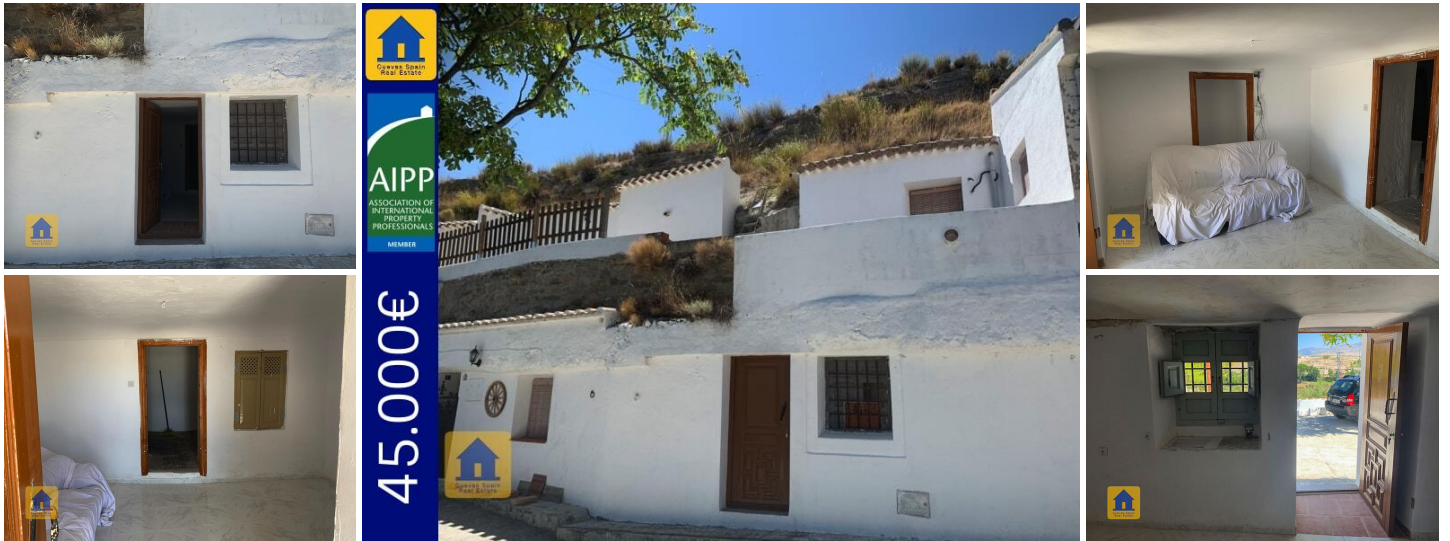
Cueva antonio galera

Lovely, quirky cave situated on a hillside above Galera village, 10 min walk to amenities. This cave house is set on two storeys with a terrace and has great mountain views. Downstairs is a front room that could be a living room or office and a back room that could be a bedroom or large storage space. Upstairs is a central dining or living room area with a fireplace, surrounded by 2 nice-sized bedrooms (one with ensuite bathroom), kitchen, and a cosy sitting room that looks out onto the terrace. This property is already liveable but needs some updating. Outside is a large, communal patio, with a covered space for table and chairs, and a parking space that is shared with neighbours. A private parking area is down below the patio (not pictured). This is a charming property that is well priced.