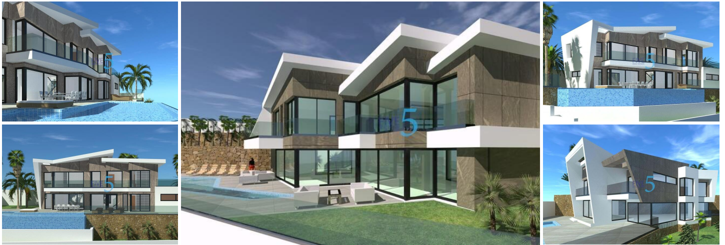
NEW BUILD LUXURY VILLA WITH SEA VIEWS IN CALPE

New Built residential of 4 Luxury villas in Calpe.