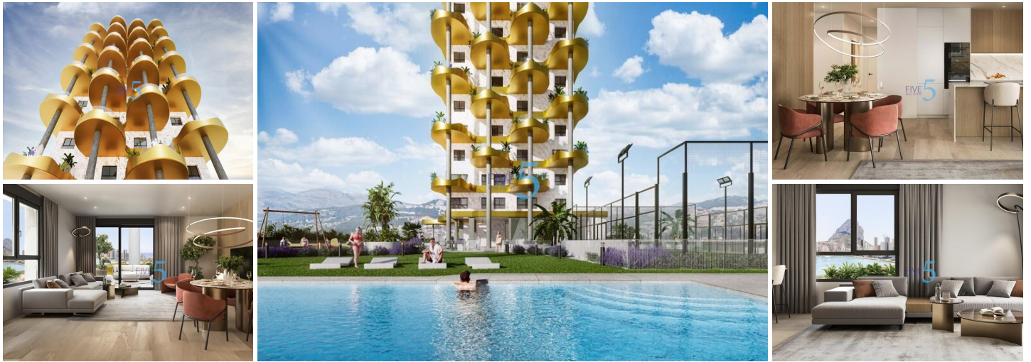
NEW BUILD APARTMENTS IN CALPE

Luxury New Build residential complex in Calpe.