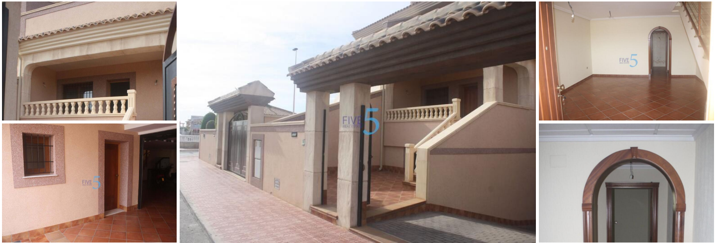
BEAUTIFUL TOWNHOUSE IN LOS ALTOS, TORREVIEJA

Key Ready New townhouse in Los Altos located few minutes away from Hospital of Torrevieja and pink salt lake.