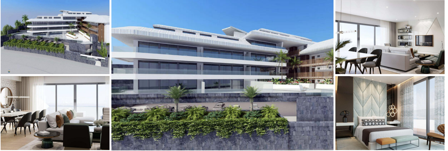
PENTHOUSE - TORREBLANCA

This stunning penthouse located in the La Corniche residence in Torreblanca offers a luxurious and contemporary living space. With its 3 bedrooms and 2 bathrooms, including one en-suite with the master bedroom, this apartment is ideal for those seeking spacious and comfortable accommodation.