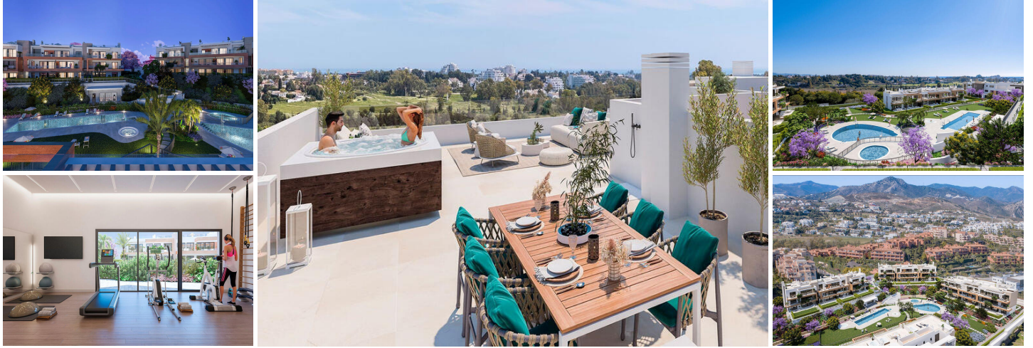
FILIPPA penthouse - South facing with sea view - New construction - Estepona / Atalaya

This penthouse is ideally located in the Atalaya area in Estepona, close from the prestigious Atalaya golf, Atalaya international school, shops and only few minutes away from Puerto Banus.