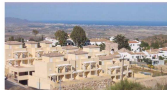
RESIDENCIAL LA FUENTE 4 VIVIENDAS ADOSADAS CON GARAJE, ZONAS COMUNES Y PISCINA COMUNITARIA. PROYECTO CASA HORMIGOS DE BÉDAR S.L.