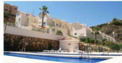
RESIDENCIAL LA ATALAYA