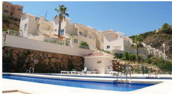
RESIDENCIAL LA ATALAYA 2 a FASE VIVIENDAS ADOSADAS CON GARAJES, ZONAS COMUNES Y PISCINAS COMUNITARIAS. PROMOTORA: EL PINAR DE BÉDAR, S.A.